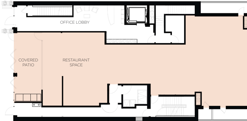
Ground Floor Plan SPACE 1 - 3,000 Square Feet