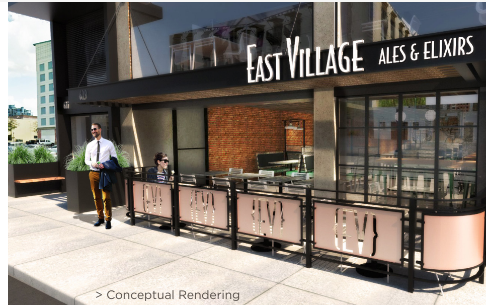
> Conceptual Rendering

Massive renovation recently completed for prime restaurant space located in the heart of exploding East Village, Downtown's largest urban neighborhood. This thriving urban enclave is home to more than 700 businesses and major San Diego landmarks including: Petco Park, San Diego Central Library, Harbor Drive Pedestrian Bridge, San Diego's Arts District, Thomas Jefferson School of Law, NewSchool of Architecture and Design, and San Diego City College.