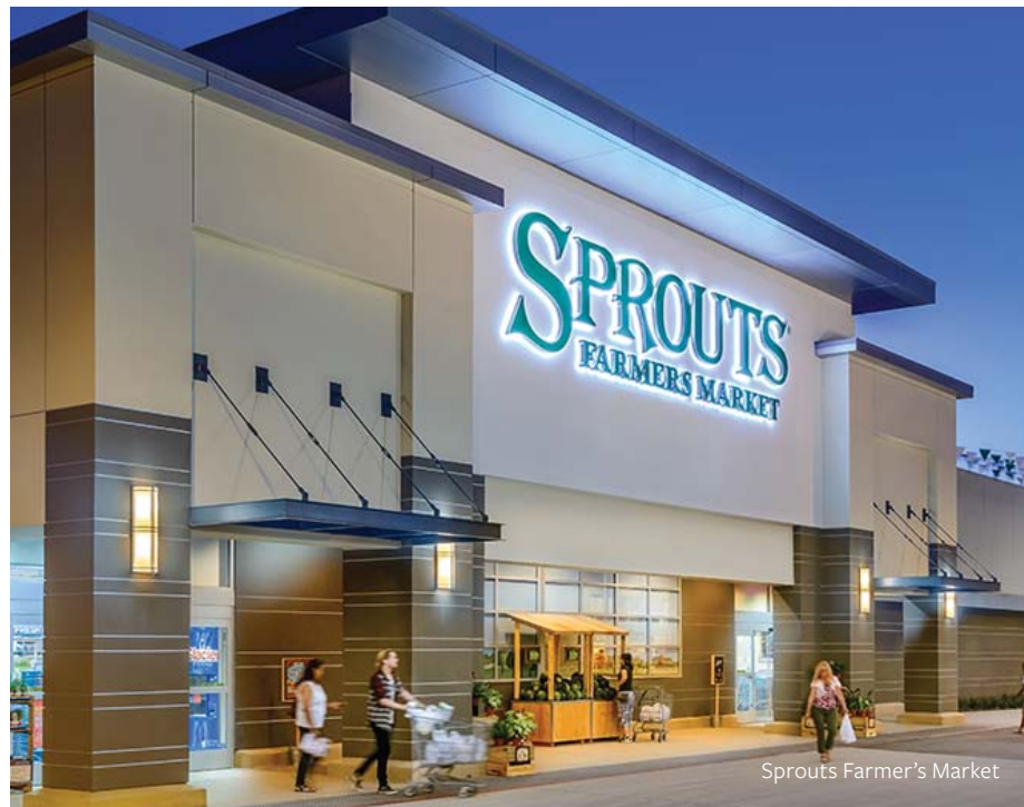
Sprouts Farmer's Market