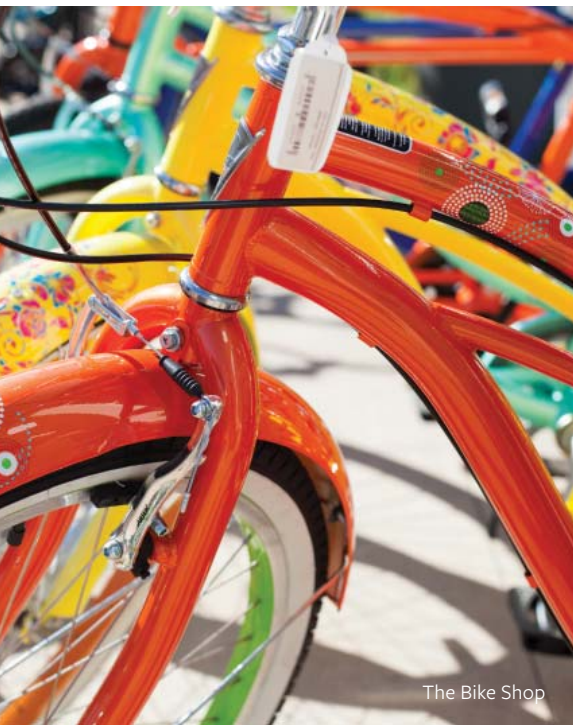
The Bike Shop