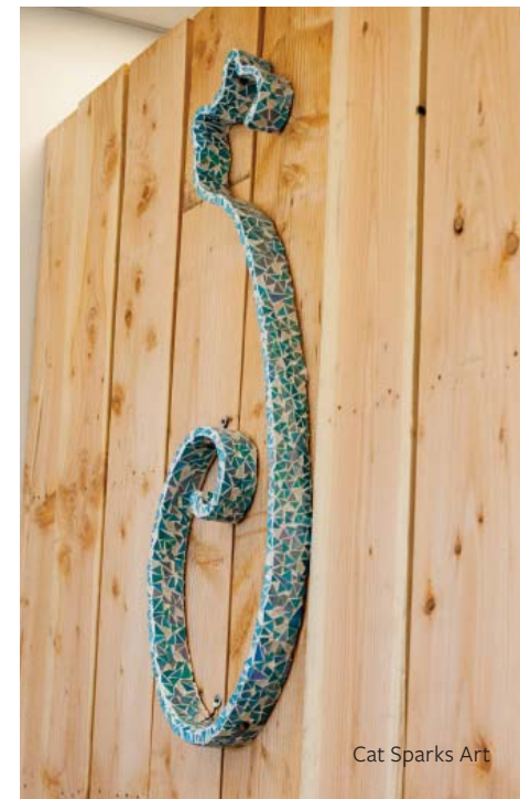
Cat Sparks Art