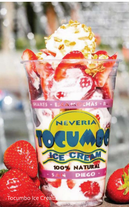
Tocumbo Ice Cream