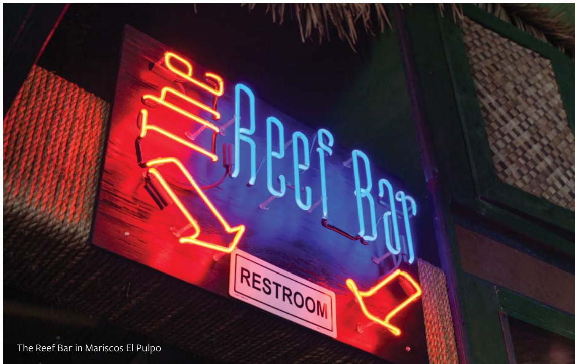
The Reef Bar in Mariscos El Pulpo