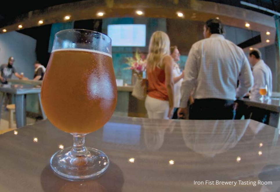
Iron Fist Brewery Tasting Room