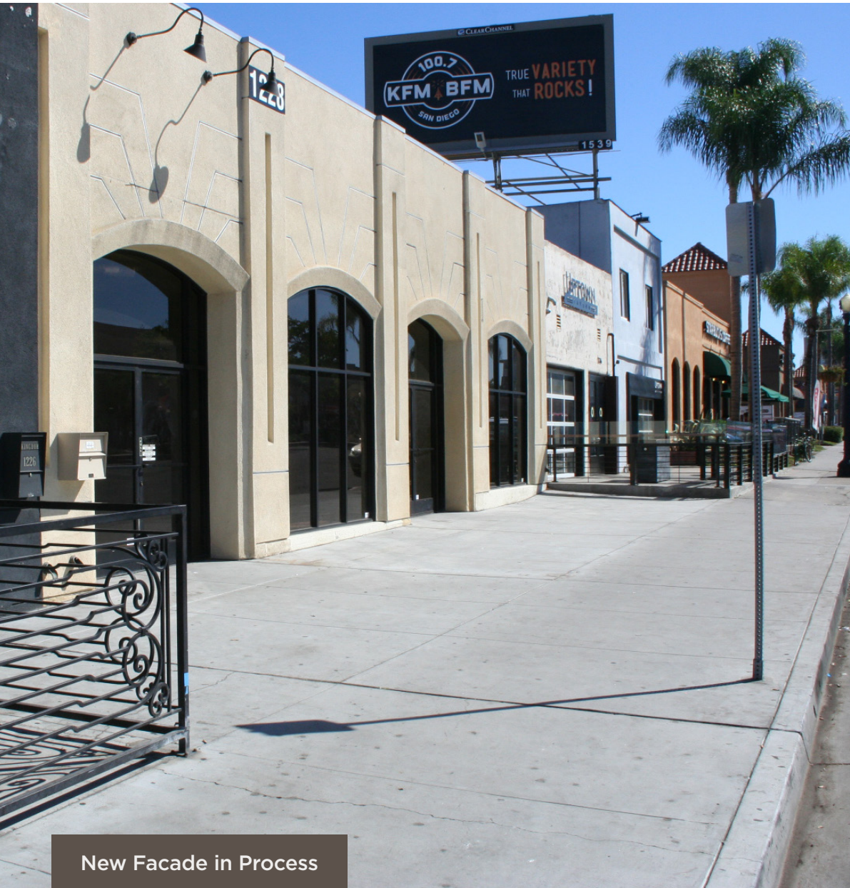
New Facade in Process