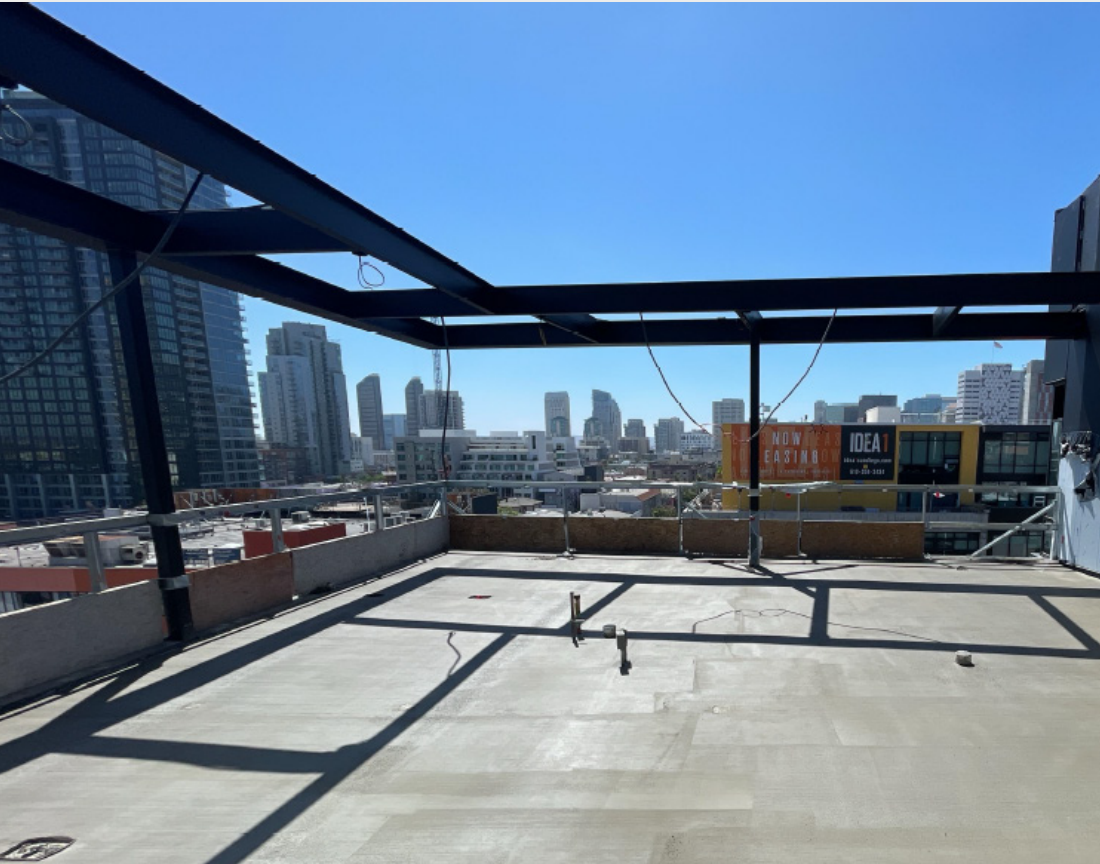
As of May 2022