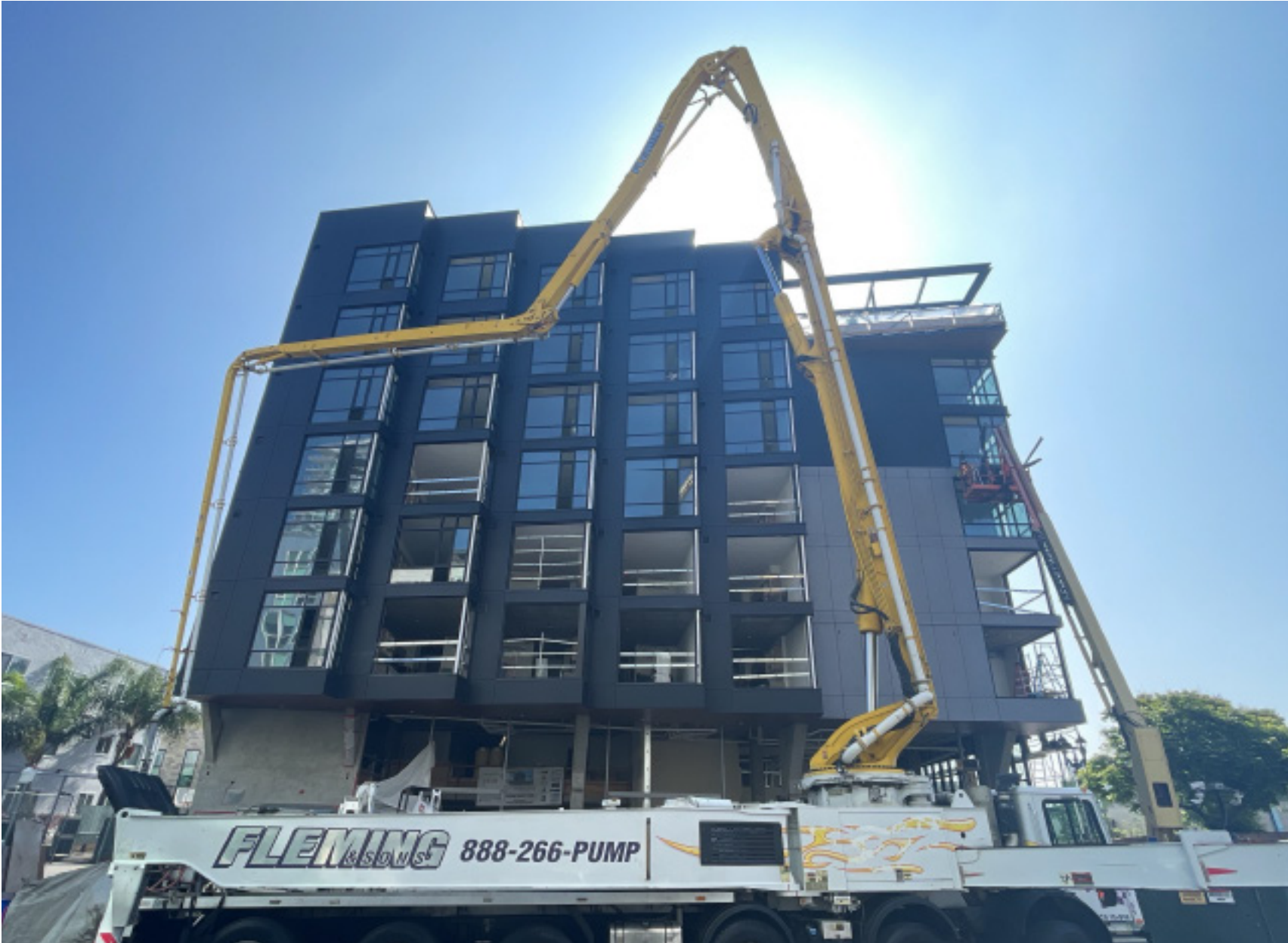
Summer 2022 Delivery