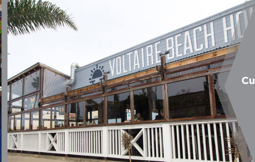
Currently Voltaire Beach House