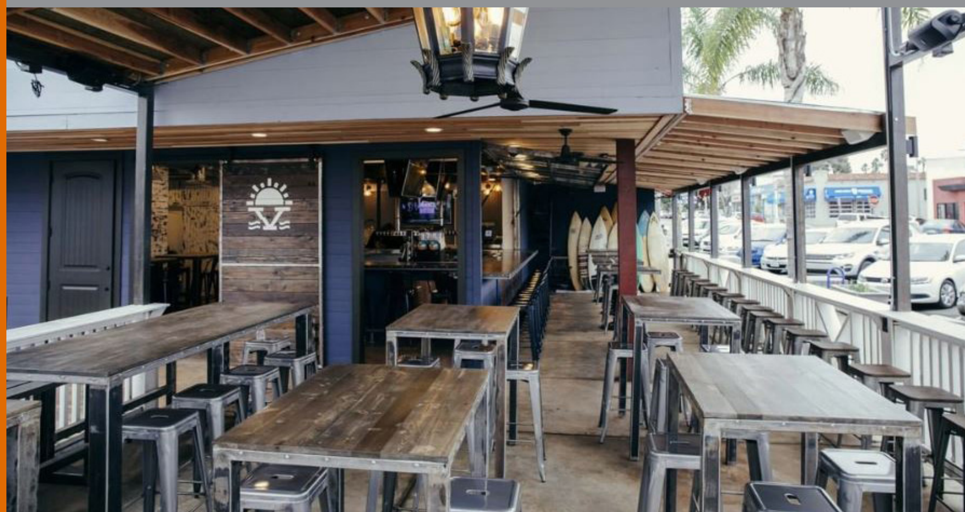
OB restaurant with large indoor/outdoor space