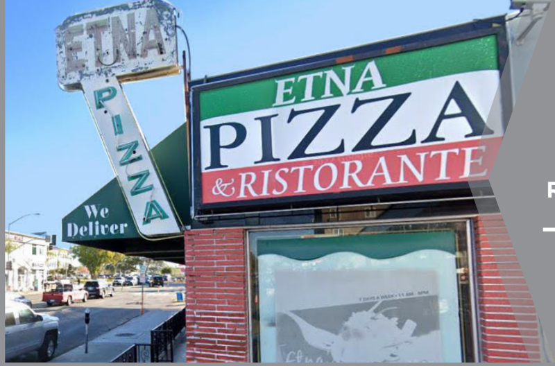
Street Facing Rooftop Signage