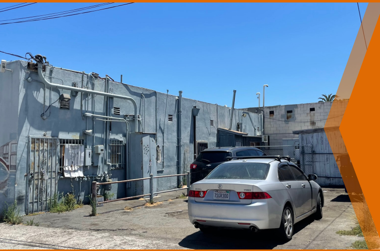
Off-Street Tandem Parking Dedicated to Restaurant Employees