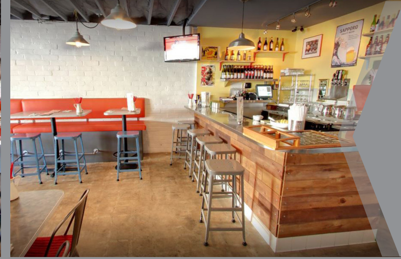
Currently East Village Asian Diner