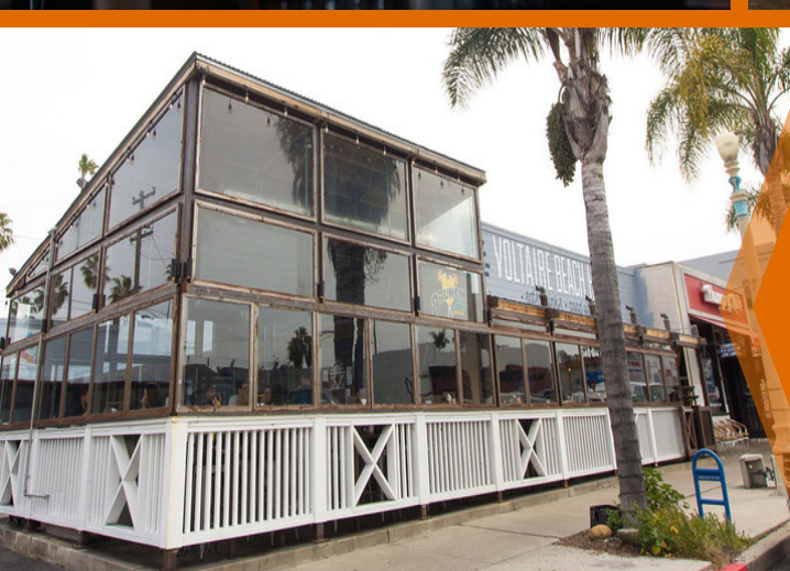
OB restaurant with large indoor/outdoor space