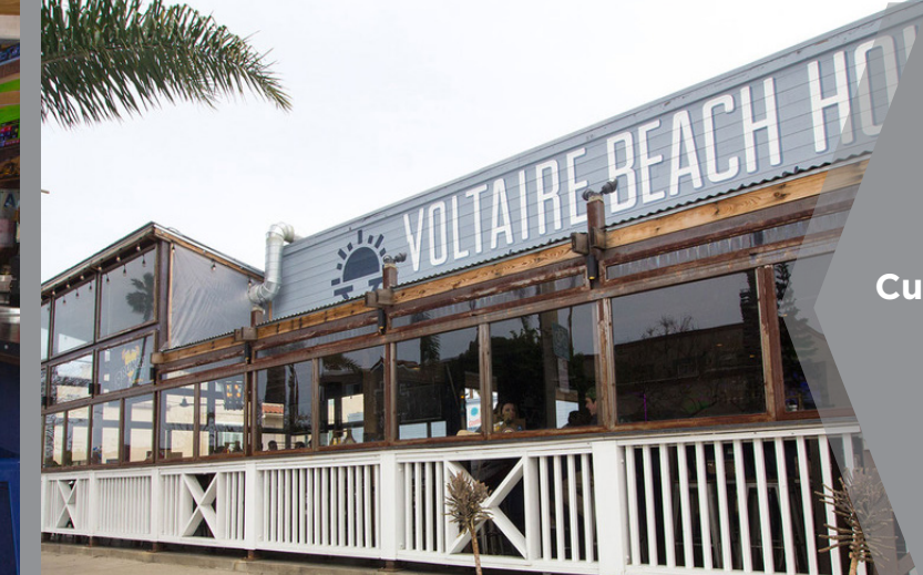
Currently Voltaire Beach House